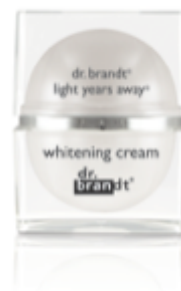
Dr Brandt Light Years A Whitening Cream - $215