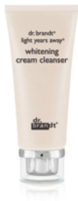
Dr Brandt Light Years A Whitening Cream Cleanser - $75